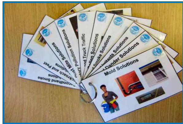
UNC Center for Environmental Health and Susceptibility Community Outreach and Engagement Core Asthma Trigger Toolkit